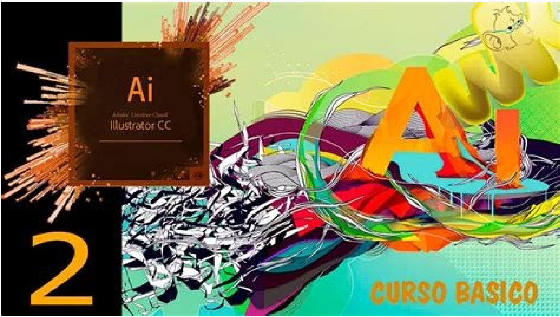
Best free adobe illustrator tutorials. Adobe illustrator cc 2020 tutorial pdf free download. Adobe illustrator cc bangla tutorial pdf free download. Is adobe illustrator cc free. Is adobe illustrator free for students.